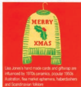
Lisa Jones's hand made cards and giftwrap are influenced by 1970s ceramics, popular 1950s illustration, flea market ephemera, haberdashers and Scandinavian folklore