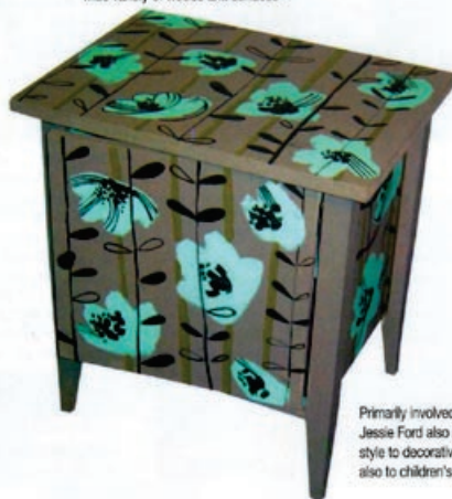
Primarily involved in illustration, Jessie Ford also applies her unique style to decorative furniture and also to children's wall murals