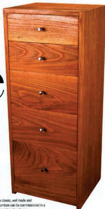
Alex Henebury's classic, well made and well-designed furniture can be commissioned in a wide variety of woods and surfaces