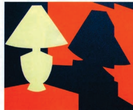
Painter Katherine Lubar is interested in light, shadow and pattern